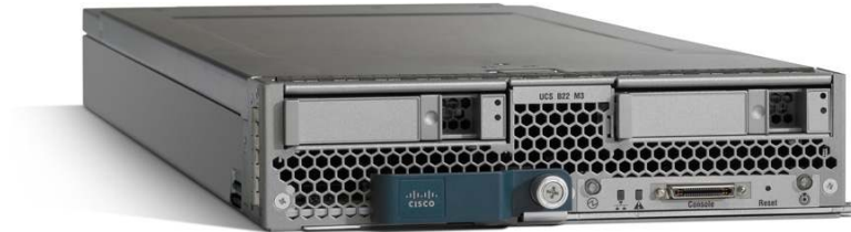
Figure 1. Cisco UCS B22 M3 Blade Server

The Cisco UCS B22 M3 further extends the capabilities of Cisco UCS by delivering new levels of manageability, price-to-performance metrics, energy efficiency, reliability, security, and I/O bandwidth for enterprise-class applications.