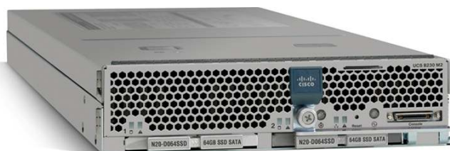
Figure 1. Cisco UCS B230 M2 Blade Server

The Cisco UCS B230 M2 is a half-width blade (Figure 1). Up to eight of these high-density two-socket servers can reside in the six-rack-unit (6RU) Cisco UCS 5100 Series Blade Server Chassis, offering one of the highest densities of servers per rack unit in the industry.