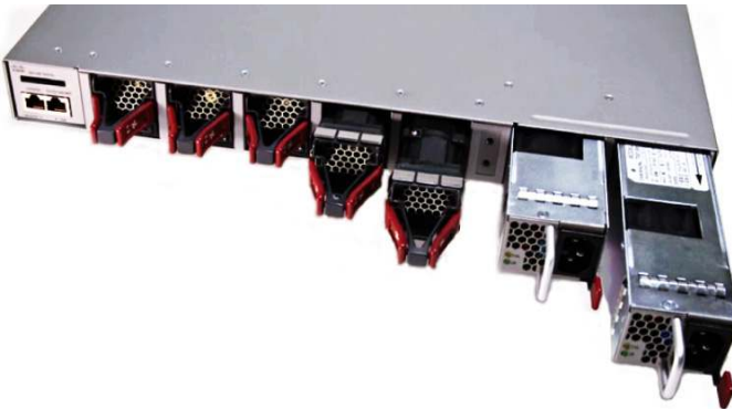
Figure 6. Redundant Fan and Power Supply

Cisco Catalyst 4500-X switch provides redundant hot swappable fans and power supplies (Figure 7) for highest resiliency with no single point of failure.