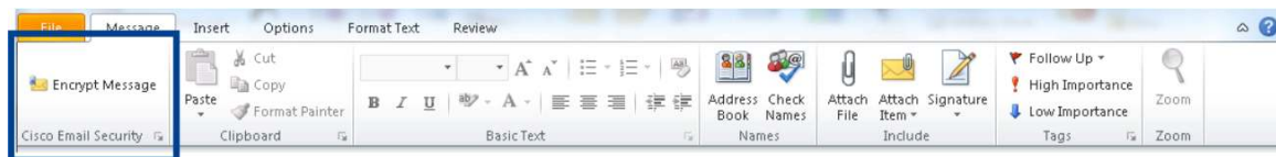
Figure 2. Cisco Email Security Encryption Plug-in

An “Encrypt Message” button installed on the menu bar of each Microsoft Outlook email message (Figure 2) enables users to encrypt email in two ways: